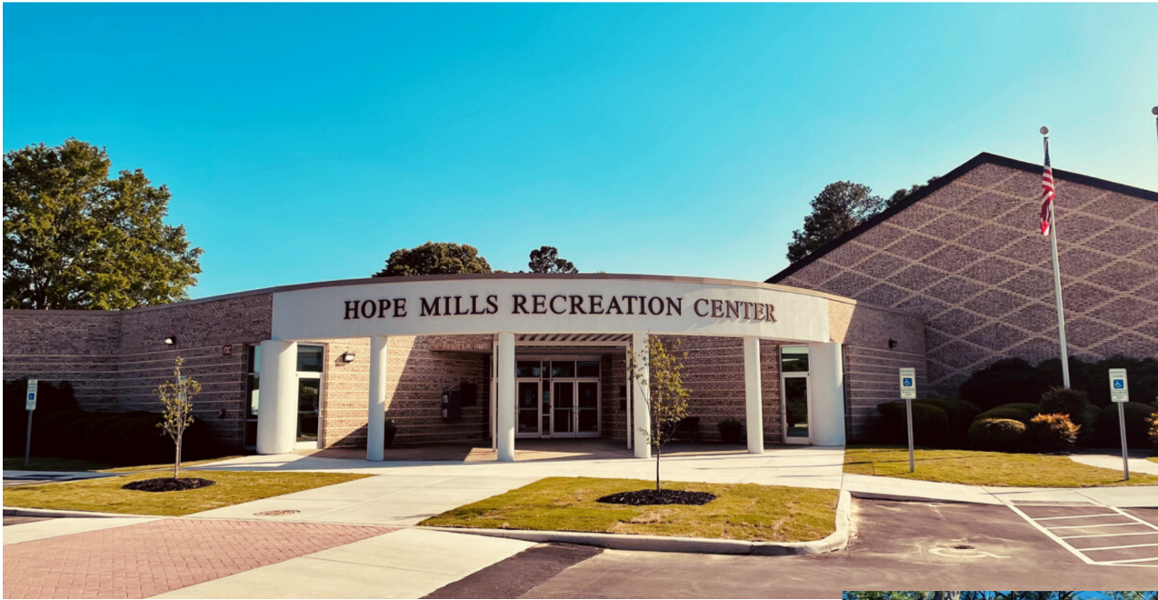
Hope Mills Recreation Center (pictured left)